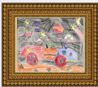
BEST OF SHOW WINNER

Entries were judged by a panel of design professionals, and a cash prize was awarded to the winner of each grade level, as well as one for Best in Show. With 200 entries received, choosing the winners was no easy task!