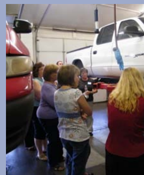
Attendees gather around to get a close-up look