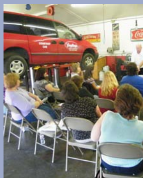
A short lecture is part of the program

We thank all the ladies who joined us for this event and look forward to our next one!