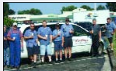
The Yingling gang enjoys some ice cream to thank them for a job well done.

P.s. Here's some money for you to buy an ice cream cone for everyone at Yingling's.