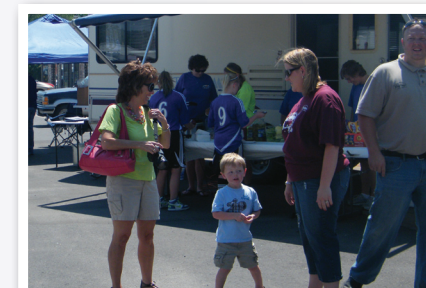
It was a great day for a party!

Thank you to all who spent the day with us. We're looking forward to doing this again.